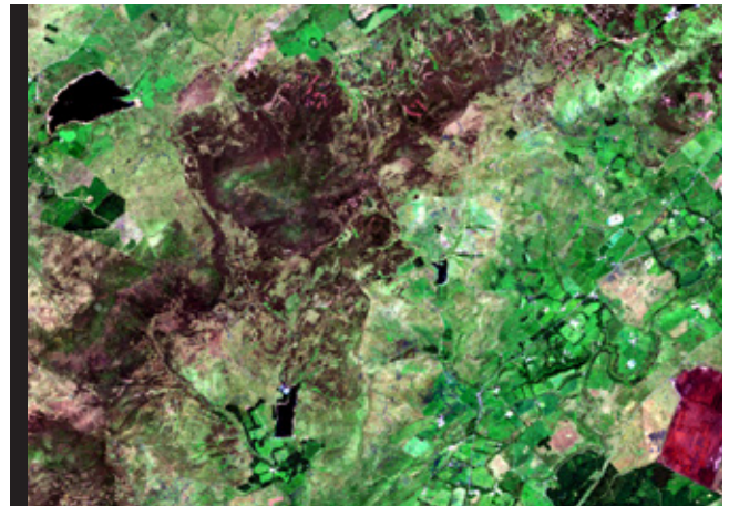
The EIDF supports the Data Slipstream project, which is working to bring together the large, diverse and complex datasets vital to Earth Observation (EO) research. This satellite image, which is stored on EIDF as part of the Data Slipstream project, shows a cloud-free mosaic of the Pentland Hills in summer 2018, created on the EIDF from over 100 Sentinel-2 satellite images.

EIDF includes a data catalogue where projects can donate research data for long-term storage. Researchers can process these data using EIDF compute services or copy these to another infrastructure. Read access is determined and controlled based on the licence set by the donating party. Data is moved in, moved out, and moved around EIDF through a diverse offering of data transit standards such as S3 and Globus.