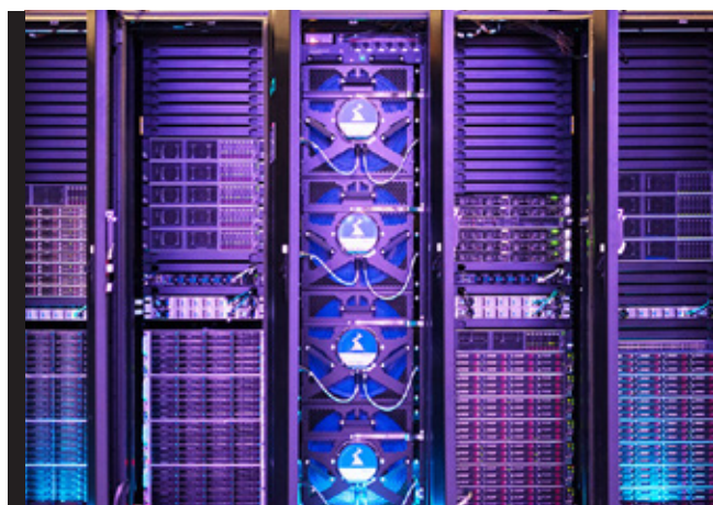
Somerville at EPCC's Advanced Computing Facility.

Somerville is funded by STFC via the LSST:UK and IRIS programmes.